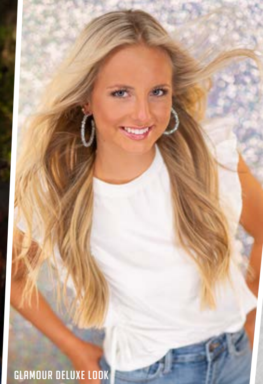
GLAMOUR DELUXE LOOK